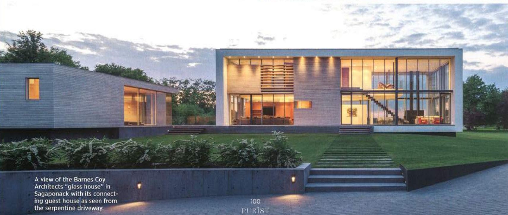
A view of the Barnes Coy Architects' "glass house" in Sagaponack with its connecting guest house as seen from the serpentine driveway.