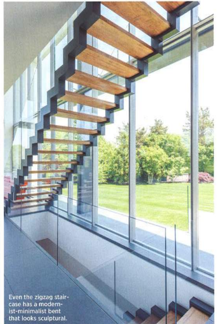
Even the zigzag staircase has a modernist-minimalist bent that looks sculptural.

What makes the house unique is the luxury of privacy. A curvy cement driveway leads up to the structure; 7 acres