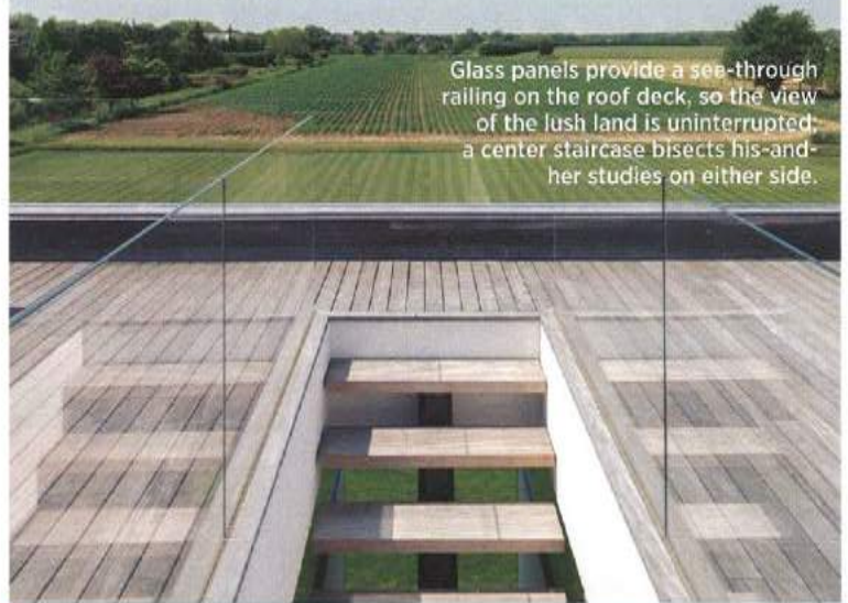
Glass panels provide a see-through railing on the roof deck, so the view of the lush land is uninterrupted; a center staircase bisects his-and-hers studies on either side.