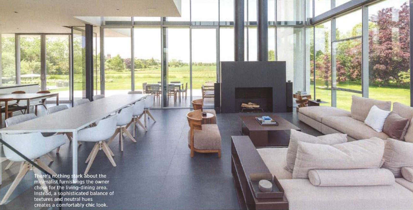
There's nothing stark about the minimalist furnishings the owner chose for the living-dining area. Instead, a sophisticated balance of textures and neutral hues creates a comfortably chic look.

one being given equal measure so they are in exquisite harmony. "No extraneous decoration and an honest use of materials," says Coy, ticking off the keys to this 8,800-square-foot, two-story home that includes a guesthouse, a lower "wellness" level with spa, sauna, steam room and plunge pool, and recreation room. While modernist designs can sometimes appear severe and cold, even unwelcoming, both the white facade and light-filled interiors feel open, airy and inviting. The sound of water contributes to the calming environment: a pristine black granite lap pool waterfalls into a whirlpool/Jacuzzi in the sunken terrace below.