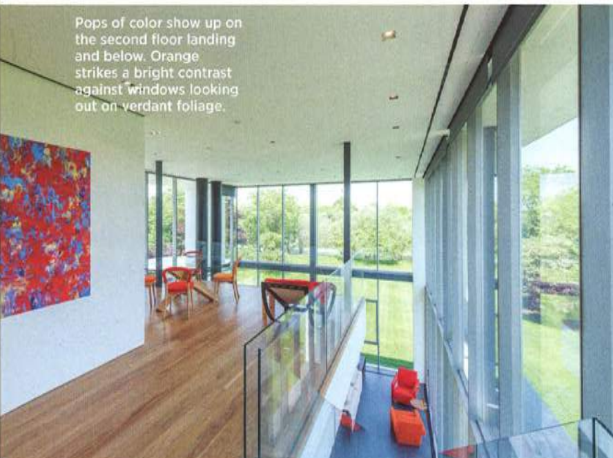
Pops of color show up on the second floor landing and below. Orange strikes a bright contrast against windows looking out on verdant foliage.