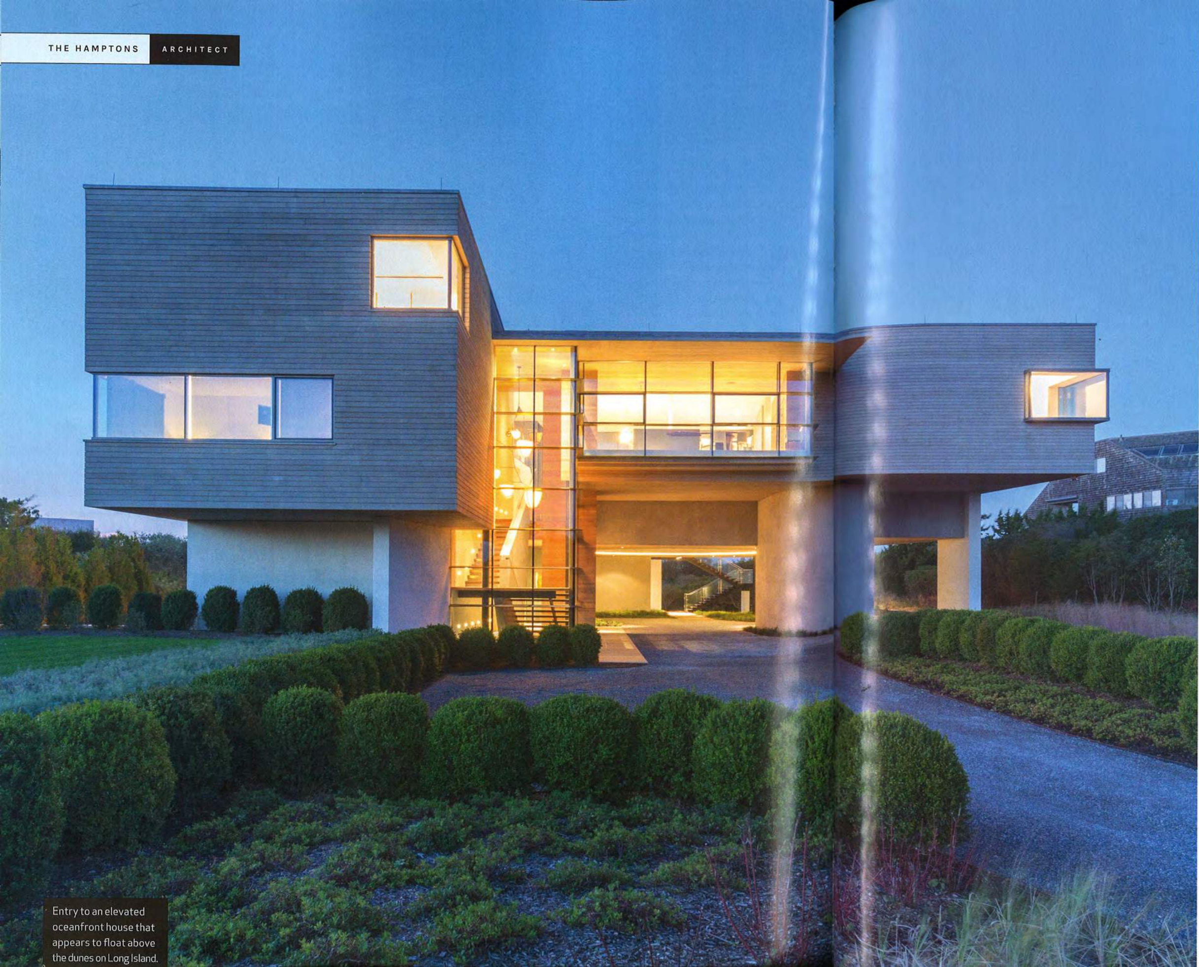
Entry to an elevated oceanfront house that appears to float above the dunes on Long Island.